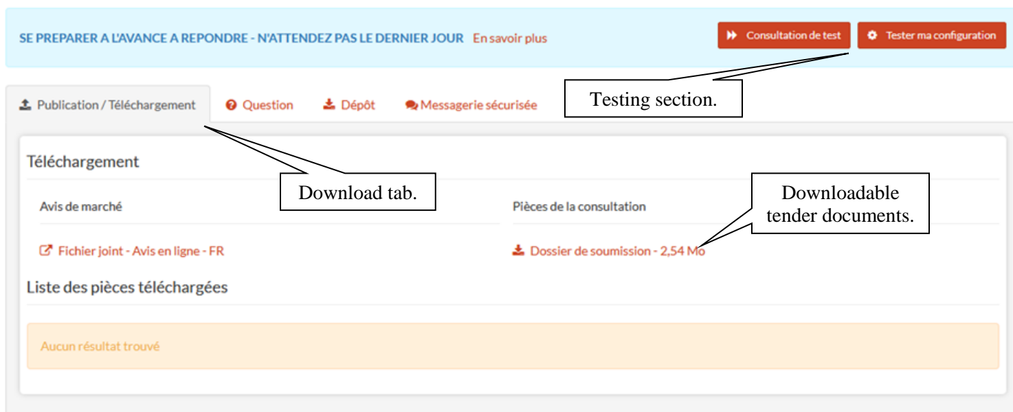
Download section of the tender documents on the Portal

In order to protect the confidentiality of the information made available in the “Questionnaire and Performance file” and the “Investment Management Agreement”, these documents need to be requested separately via the Portal. In order to do so, tenderers should use the “Poser une question” button in the “Question” tab while uploading the duly completed “Model request to obtain the tender documents” (Appendix 8 within the downloadable tender documents on the Portal).